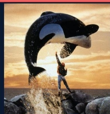
FAMILY FILM Free Willy 15 February