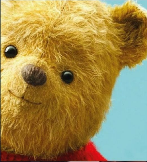
FAMILY FILM CLUB Christopher Robin 18 January