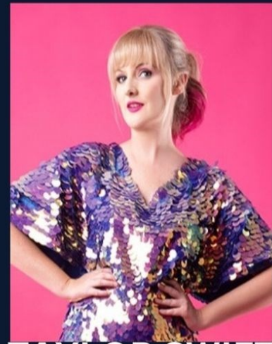
TAYLOR SWIFT TRIBUTE 19 February