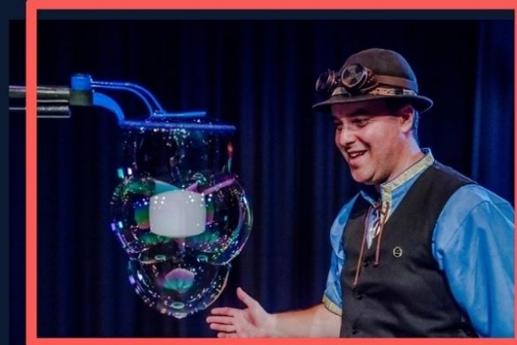
THE BUBBLE SHOW 2 February