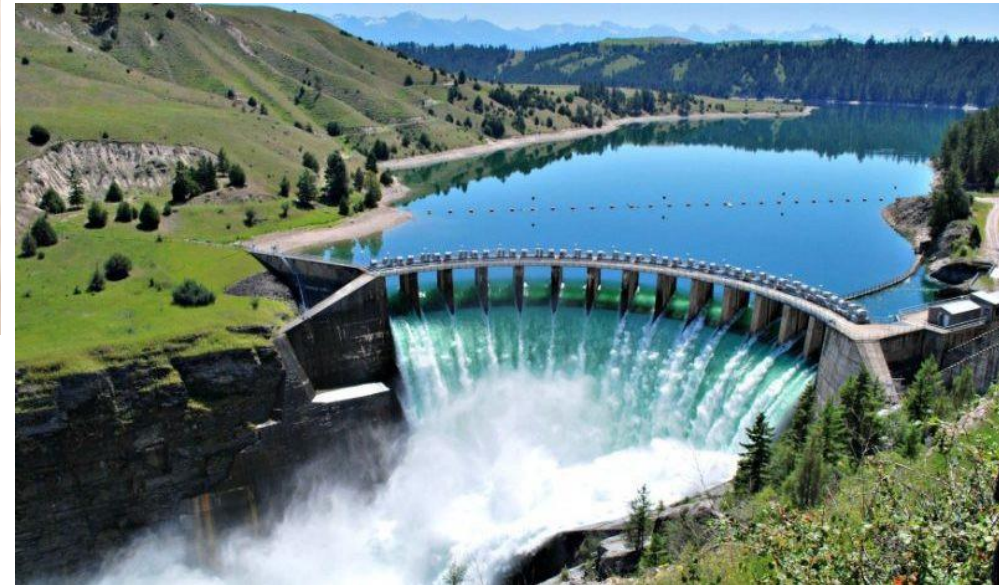
Water is a clean source of power