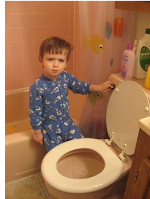
We need water to flush our toilet