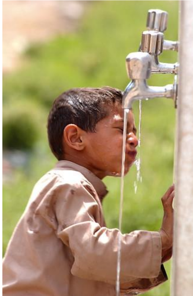
Our bodies need a lot of water to keep them healthy