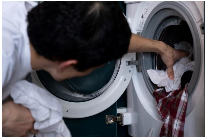
Washing our clothes