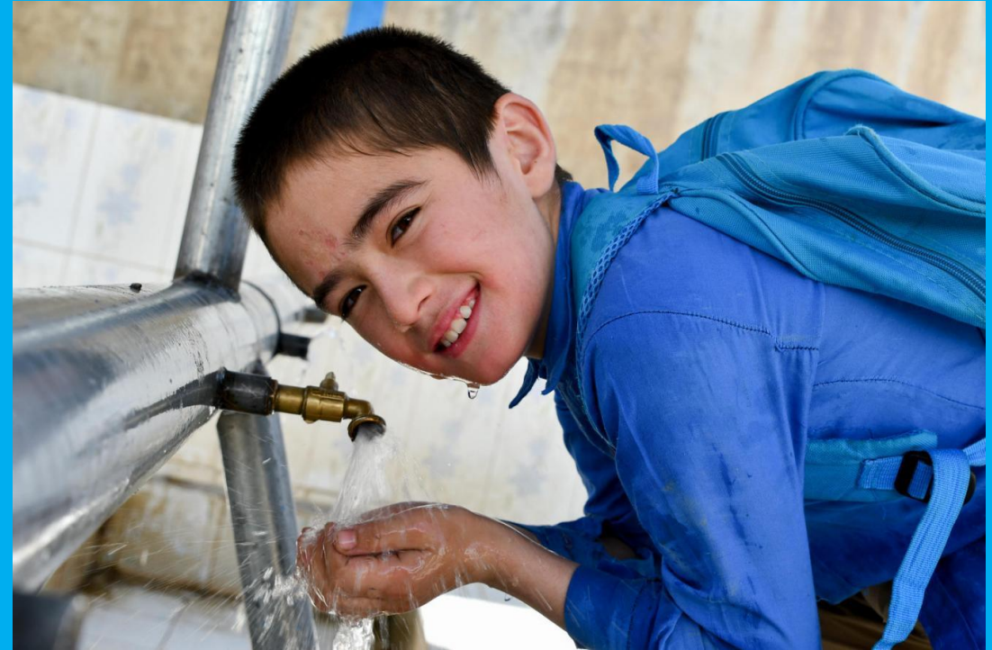
School in Faizabad, Afghanistan